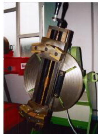
HP Range (see chart left)