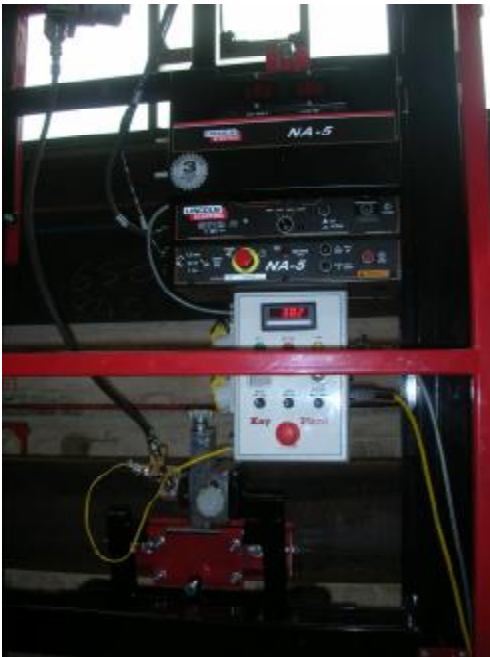
Machine fitted with a Digital Speed Display, Lincoln NA-5 Control Box and DC655 Power Source