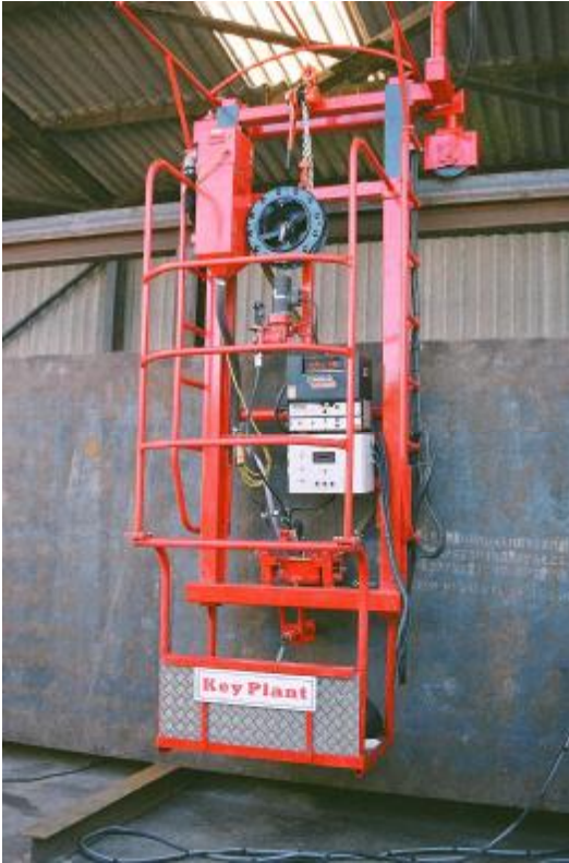
Key Plant Single Sided Girth Welding Machine