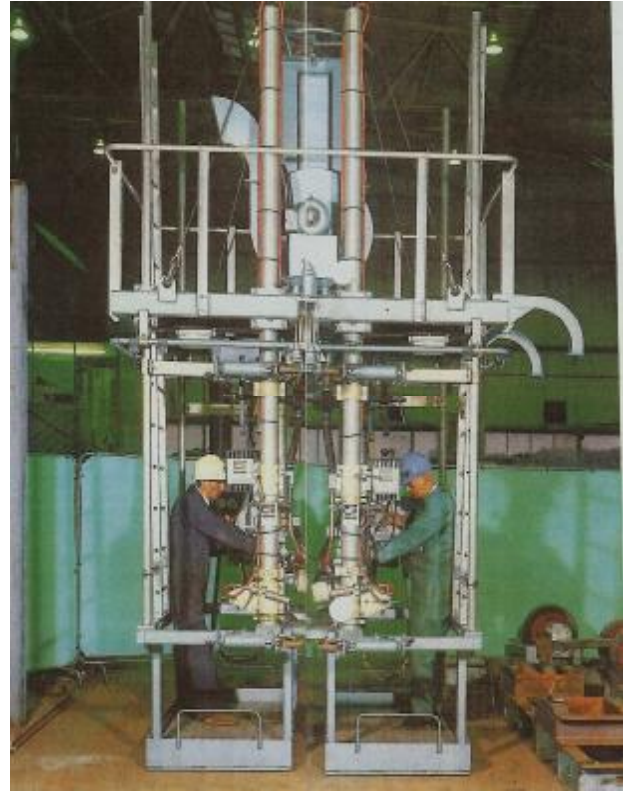
Key Plant Double Sided Girth Welding Machine